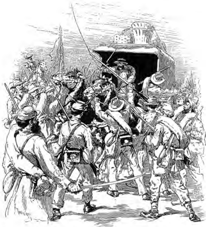
Figure 6. A Union sutler being halted in a Confederate Trap.

part to the rapidly expanding volunteer forces. Of course, not all sutlers were evil and they definitely provided a morale boost, distributing luxury items not available anywhere else. Among these items were clothing, shaving and toilet utensils, matches, candles, pans, dishes, knives, and patent medicines. Due to the frequently inadequate rations issued soldiers in the field, the sutlers stocked a vast selection of foodstuffs as well. Other items he provided were pipes, tobacco, playing cards, games, stationery, pens, ink, newspapers, books and liquor (often officially prohibited). 23