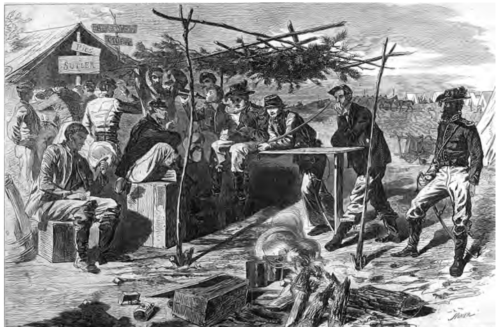
Figure 5. "Thanksgiving in Camp," a sutler scene, Harpers Weekly , Nov. 26, 1862.

The "one sole sutler per regiment" created a great opportunity for greed to set in, no competition, a defined captive market. The soldiers could either pay the sutler's prices or go without. This environment spawned corruption, exorbitant prices, and poor quality goods due in large