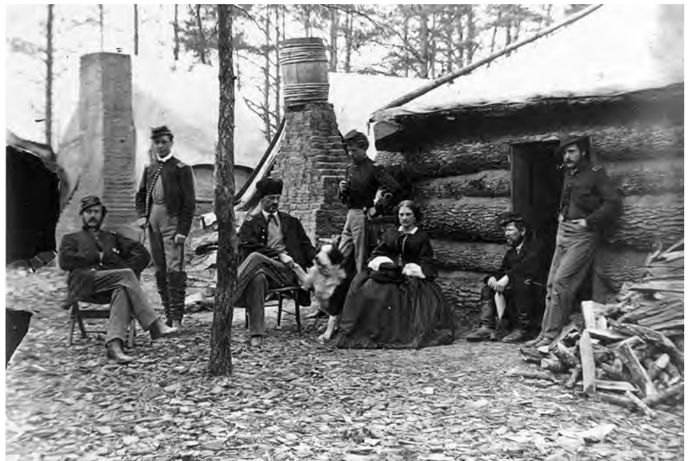
Figure 7. Brandy Station, VA, Feb. 1864, Officers and a lady at Headquarters of 1st Brigade, Horse Artillery.

While Congress was figuring out how to fund the war effort in 1861, Massachusetts Congressman Henry Wilson